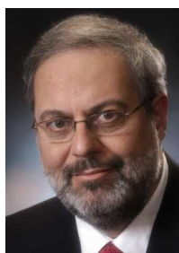
Mr. Pierre Arcand

Minister of International Relations and Minister responsible for La Francophonie (Quebec)